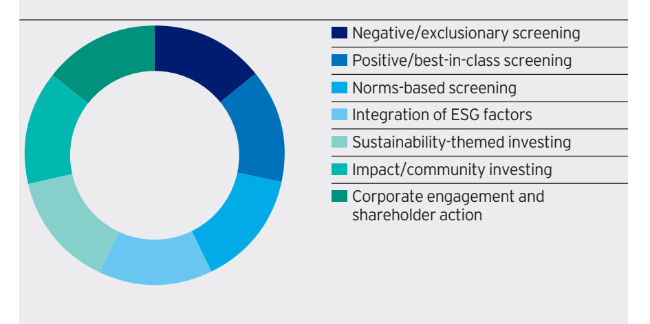
Figure 8 As detailed in its 2016 Global Sustainable Investment Review, the GSIA has distilled various socially responsible investment techniques into seven specific categories. They are as follows: