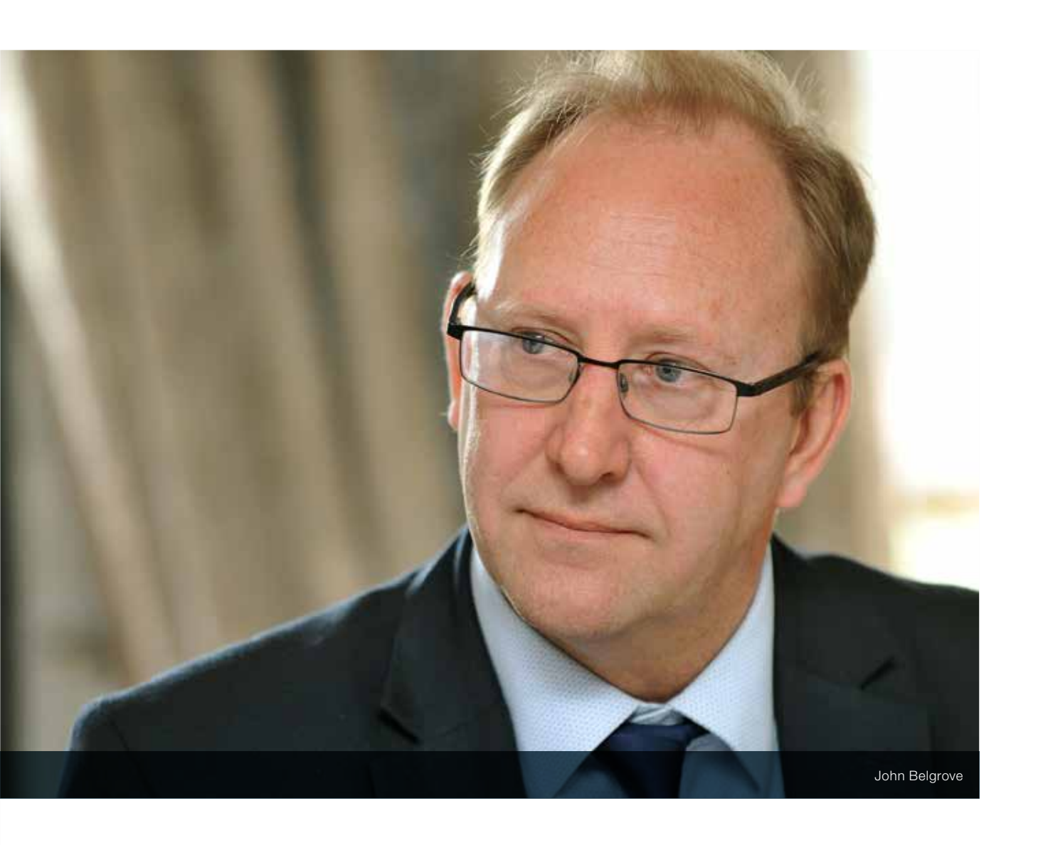
"What's been important is moving away from flag-waving lobbyists to a more considered regulatory, policymaker and integrated approach. That's the way forward."